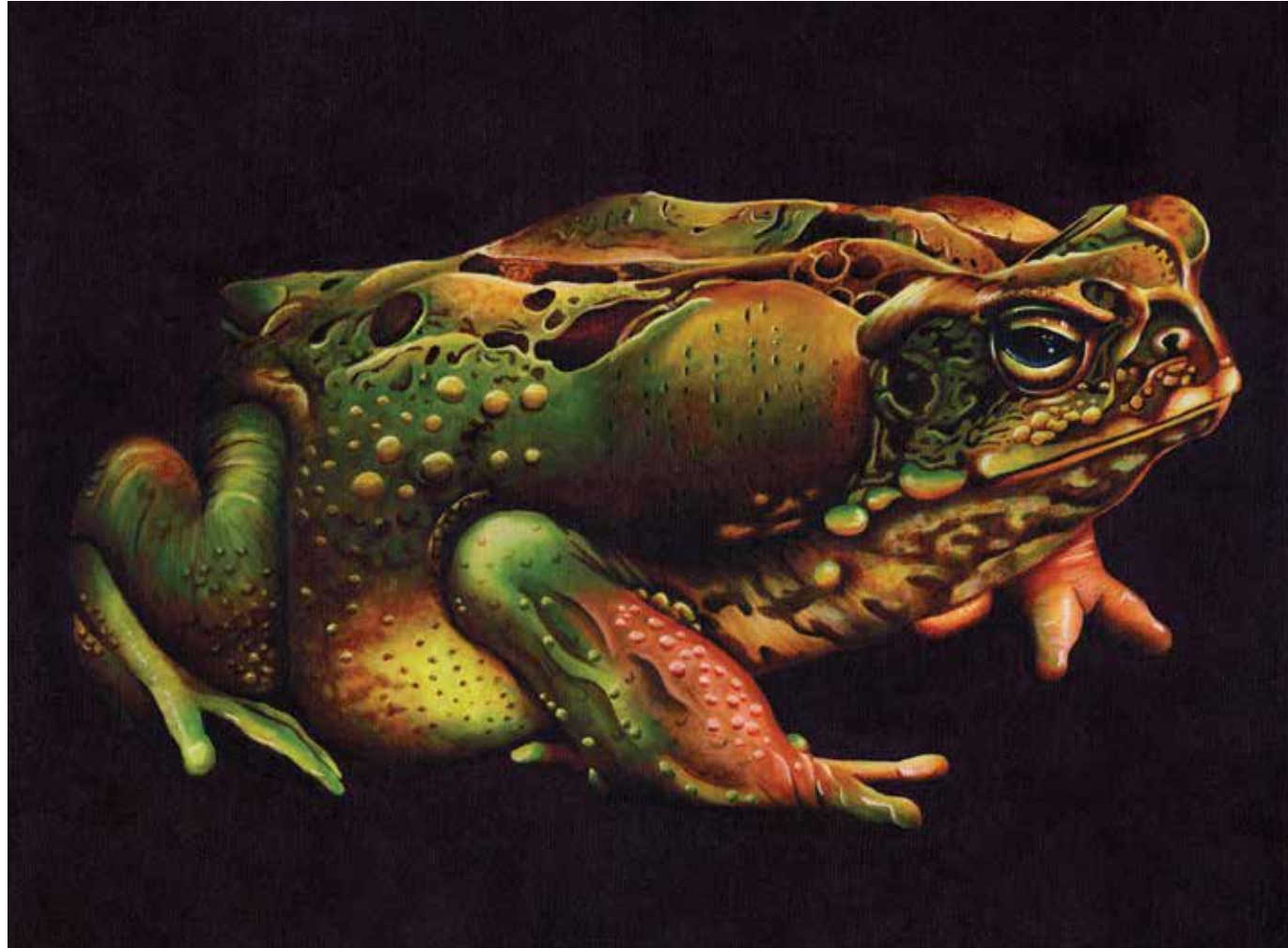
Hail to the Hypnotoad