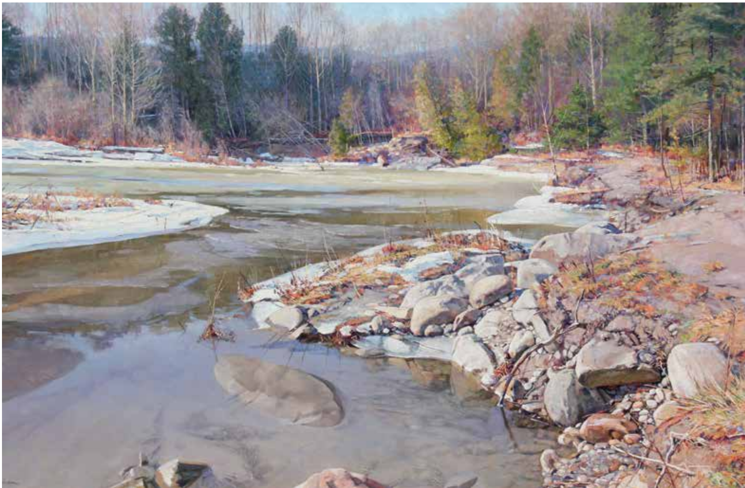
previous page, Get Your Own Fish, by Clint Jammer