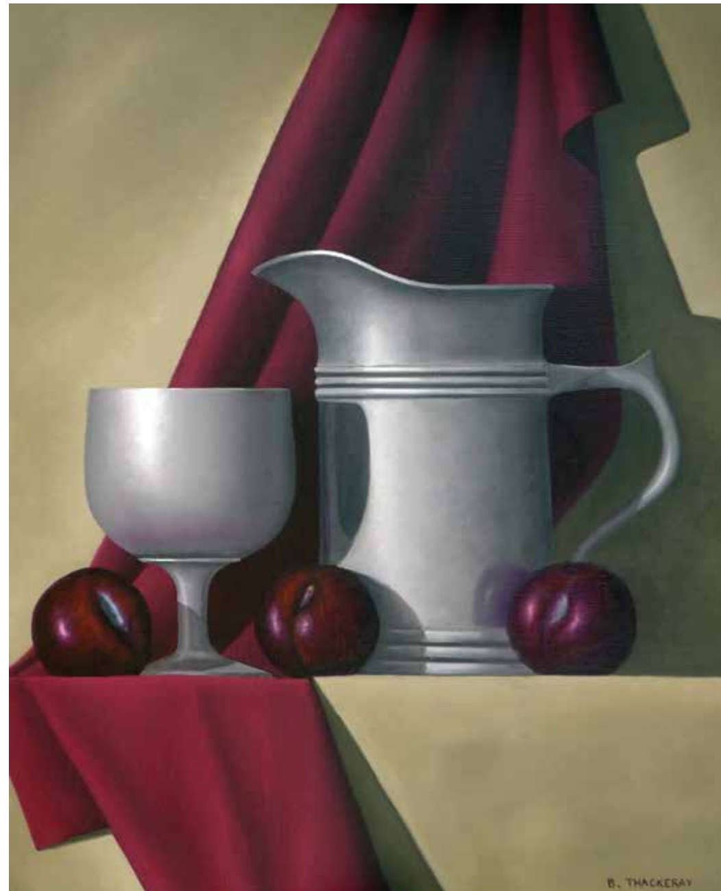
Plums and Pewter, by Bob Thackeray

always reflected the influences of nature and the outdoors. For many years the event was known as the Buckhorn Wildlife Art Festival, even though a significant amount of art on display was not of this category. A name change incorporating the term 'fine art' was chosen in 2005 to better express the variety of subject matter presented, as well as indicate the rising quality of the work itself. True to its origins, wildlife themes are still well represented but so are landscapes, rural subjects, still life and the human element. These are presented in diverse stylistic approaches and a variety of materials – in drawing, painting, sculpture, pottery, jewellery and photography. All exhibitors are on site in