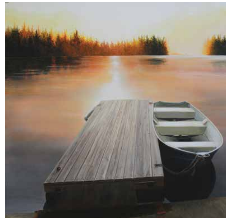
Sunrise Resort, by Mike Smith

Initially, the exhibits were housed within the Community Centre and the public school across the street. Display panels were borrowed from a local lumber supply outlet, on the condition they would be returned undamaged and free of nails. Local residents quickly lent their support to everything from erecting the display booths to promoting the event. The cooperative spirit displayed then has continued over the ensuing decades, forming a continual stream of volunteers up to the present. Over time large tents were